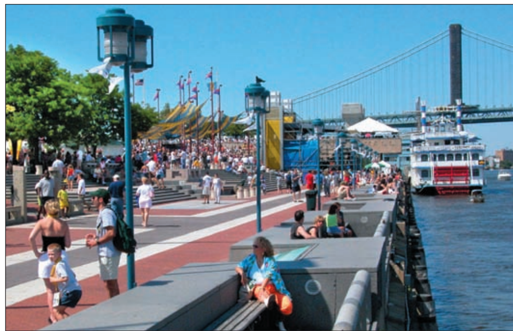
Penn's Landing scene: The Liberty Belle paddle wheel boat shut down operations.